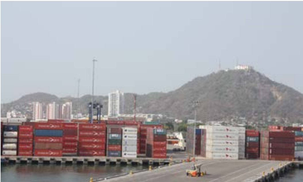
Figure 16: Standardised containers on the dockside at Cartagena, Columbia

Globalisation refers to the increasing connectivity and interdependence between countries. It normally refers to economic markets but includes the spread of ideas, culture and political systems. This has been enabled by advances in technology, communication and transport. The internet is an obvious example which has enhanced connectivity and the adoption of standardised container sizes has enabled goods to be shipped around the world at low cost (Figure 16).