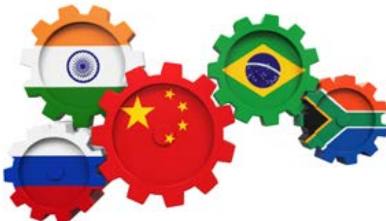
Figure 18: The BRICS Group

The Chief Economist at Goldman Sachs coined the acronym BRIC in 2001. He was referring to a group of 4 large countries (Brazil, Russia, India and China) with tremendous potential for economic development. The BRIC countries were picked out from the other emerging markets because they were expected to grow to become the world's largest and most influential economies in the 21st century. Their size was regarded as a particular advantage – the 4 countries are collectively home to more than 2.8 billion people. They also span more than 25% of the world's land mass. In 2010 South Africa joined the group. The acronym was modified to BRICS, reflecting the African country's membership. Nigeria had been a contender for membership on account of its size. However, South Africa was chosen due to its immense natural resource base, established infrastructure and advanced financial systems. Previous to the term BRICS being coined, the countries had never worked collaboratively and were separated both spatially and culturally. That situation has changed; the 7th BRICS summit was held in 2015 and focussed on the development of a multilateral bank operated by the BRICS states. Its establishment would offer an alternative to the World Bank and International Monetary Fund.