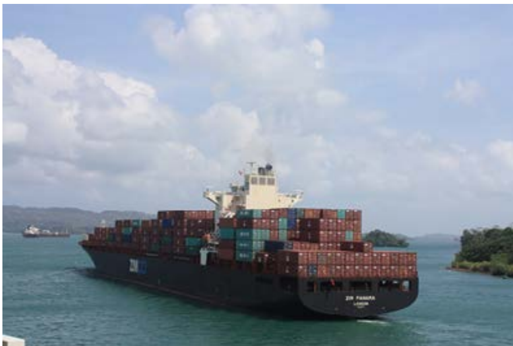
Figure 17: A Container Ship on Lake Gatún on its transit through the Panama Canal