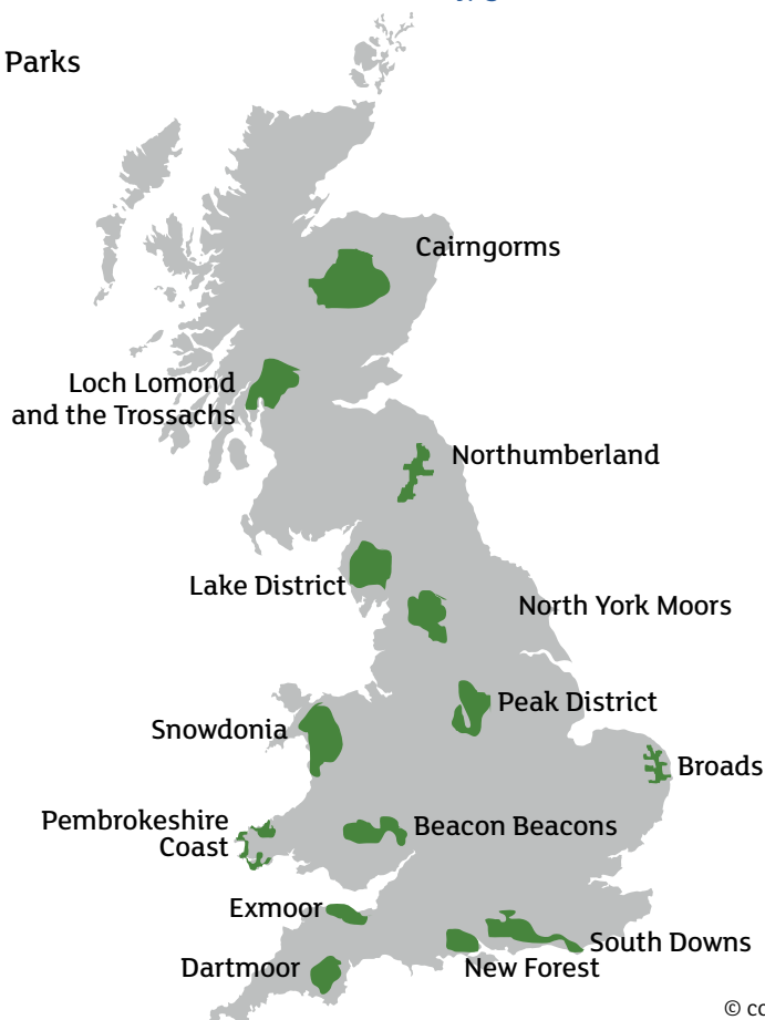
Figure 8: National Parks

http://travel.nationalgeographic.com/travel/parks/uk-national-parks-photos/#/waterfall-climbers-brecon-beacons_30902_600x450.jpg