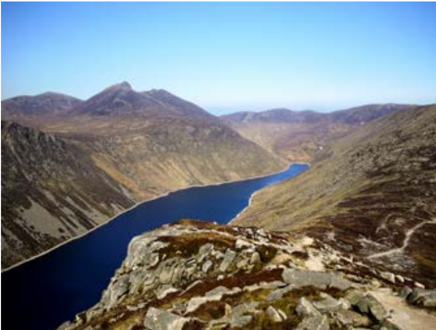
Figure 9: The Mountains of Mourne