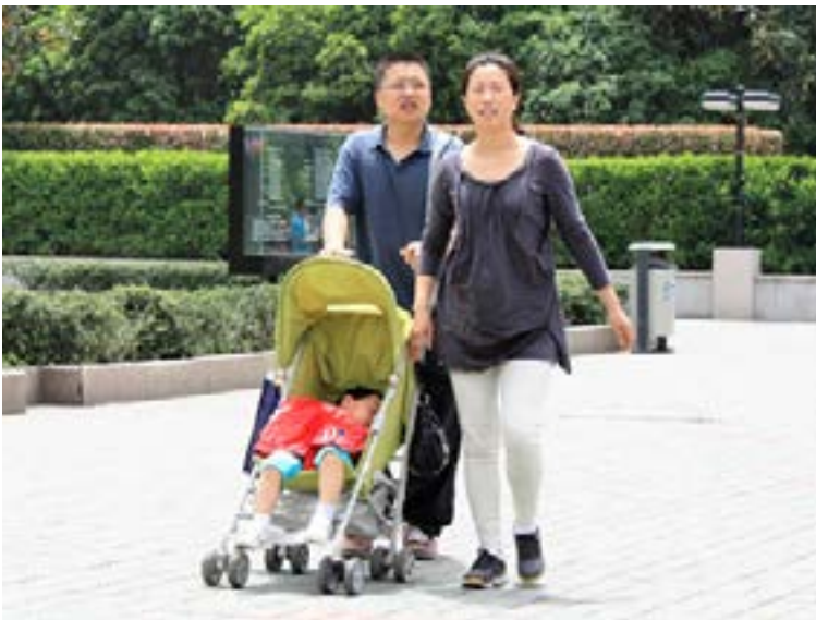
Figure 4: A couple with their one child enjoying leisure time in a park in Shanghai.

In 2015 the government brought this controversial policy to an end.