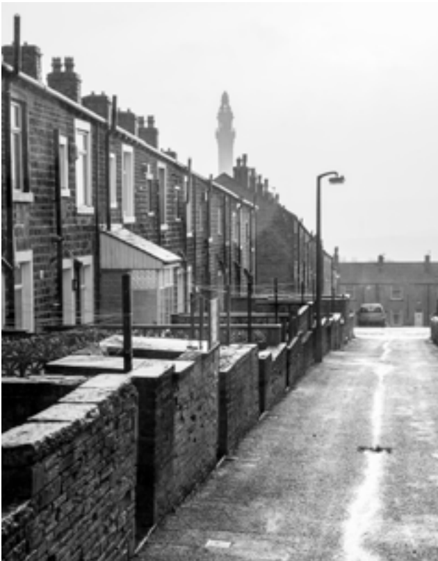
Figure 10: Typical Terraced Housing

During the 19th century industrialisation led to urban employment opportunities. Britain's cities expanded rapidly as rural people relocated in search of work; the urban population increased from 2 million to more than 20 million during the 19th century. Housing was built in close proximity to the factories to accommodate the workforce. Streets of terraced houses were constructed by private builders (Figure 10). As the urban population grew rapidly inner cities became characterised by high density neighbourhoods with many families living in overcrowded and insanitary conditions.