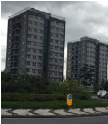
Figure 11: High-rise flats at Bellsbridge, Cregagh.

In the 1960s and 70s, large numbers of residential tower blocks were built to address the ongoing shortage of housing. Many families were still living in substandard accommodation. The plan was based around the assumption that people would enjoy high rise living; the move to apartment living had been embraced by many young professionals. In reality, many of the tower blocks were branded social and economic failures. They had shortcomings in both design and construction, which left the occupants dissatisfied.