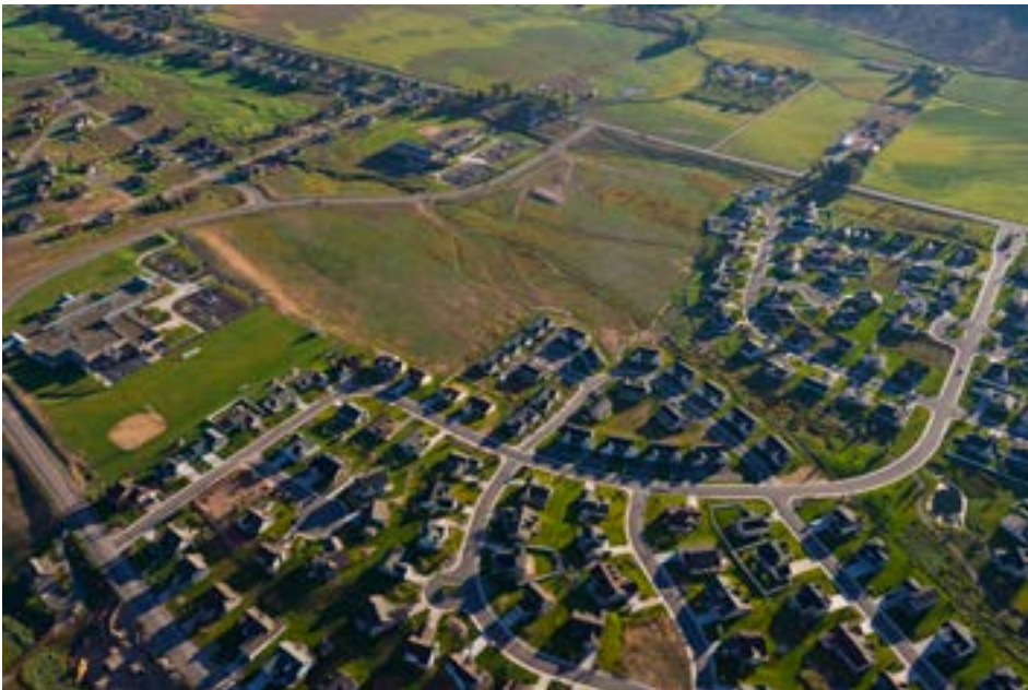
Figure 7: Distinct rural-urban fringe

The rural-urban fringe is the transition zone where urban expansion meets the rural world (see Figure 7). The land here is generally cheaper than areas closer to the CBD and the transport links are often well developed. This area is characterised by a diverse range of land uses. As urban settlements sprawl into the rural environment the rural-urban fringe can be site of friction and tension.