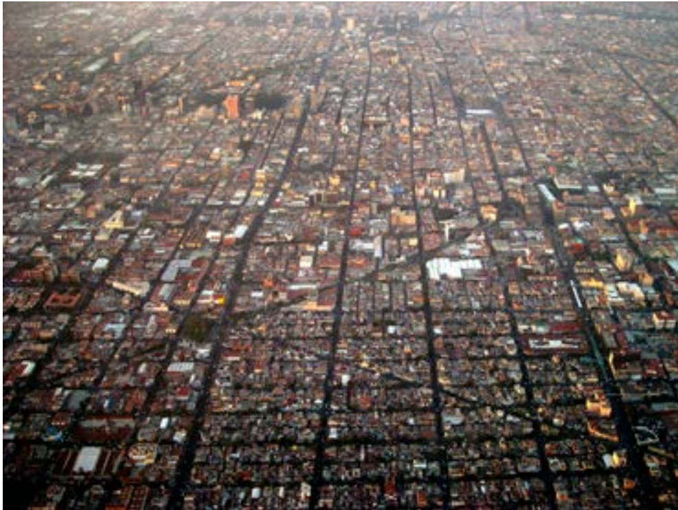
Figure 19: Mexico City

The value of Mexico's exports is approximately US$ 1 billion per day. This is over ten times the value of exports in 1994. This is in part due to the North American Free Trade Agreement which gives Mexico a competitive trade advantage over other countries.